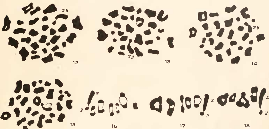
All drawings at a magnification of 3200\times (reduced from 6000\times )

The haploid number of chromosomes was determined in the primary spermatocyte. The author was surprised at finding a higher number of chromosomes in this species than that encountered in the previous form. Counts in several adequate plates established that there are 29 distinct chromosomes having bivalent nature. As seen in Figures 12 to 15, the chromosomes vary considerably in their size and shape. The configuration of some of the larger bivalents is strongly suggestive of subterminal or submedian fibre attachments. To the author's view, a few of the medium sized ones seem also to be of atelomitic nature. Four or five bivalents are extremely small in size. Outstanding in the haploid complement is a heteromorphic bivalent which is composed of a long rod-shaped element and a minute granular one, connected end to end with each other. Taking all characteristic conditions into con-